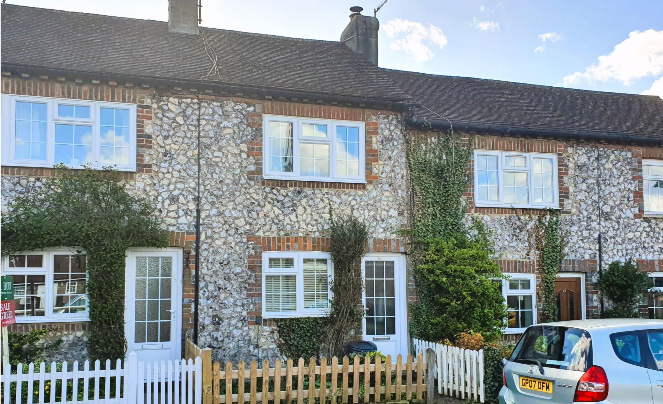
26 Charlton Street, Steyning, West Sussex.

H.J. BURT Chartered Surveyors : Estate Agents